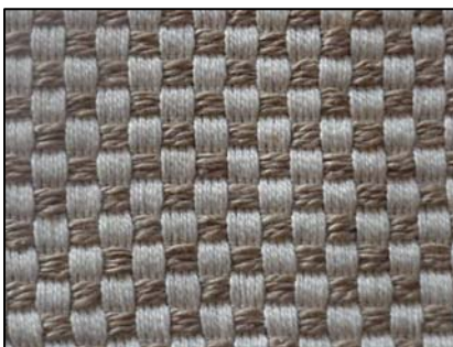
Fabric in acrylic for filling