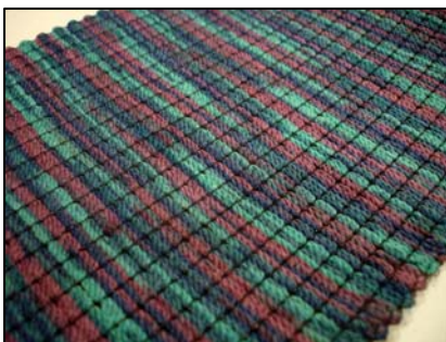
Fabric in polypropylene