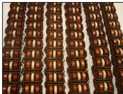
Fabric in leather