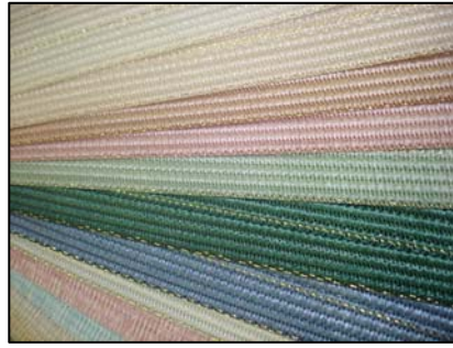
Fabrics in carbon and glass fibre