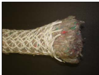
Filling cord for edges